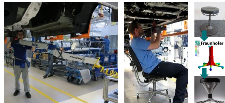
Fig. 2: Improvement measures 3-Arm, underbody seat, light-weight stool